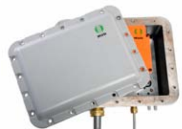
>>> TM 70 ATEX Receiver